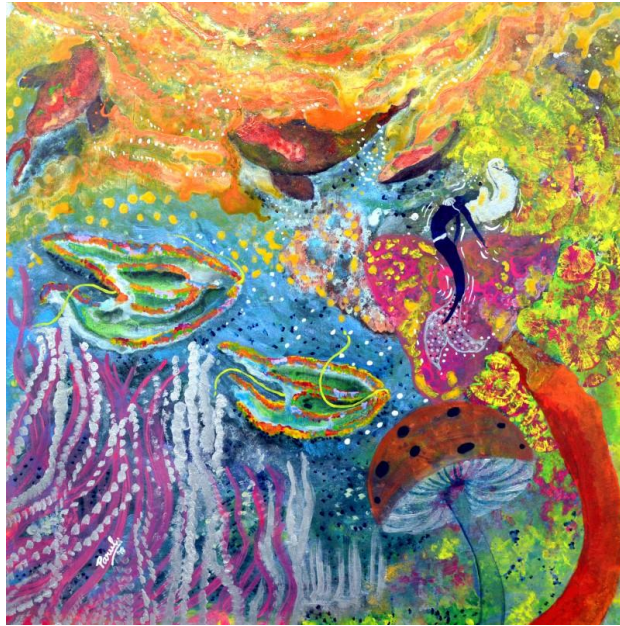
The Dream Swim. Size : 36" * 36" Medium : Acrylics on canvas. Retrieved from: THE DREAM SWIM | Parul Mehra

The poetic reflection of Parul Mehra's works allows us to wander through dynamic compositions, where however, freedom to explore does not equate a composition left to chance, where vivid and bright colors don't fall to randomness and stridency, but all parts flow consistently together, just like the longest of dreams.