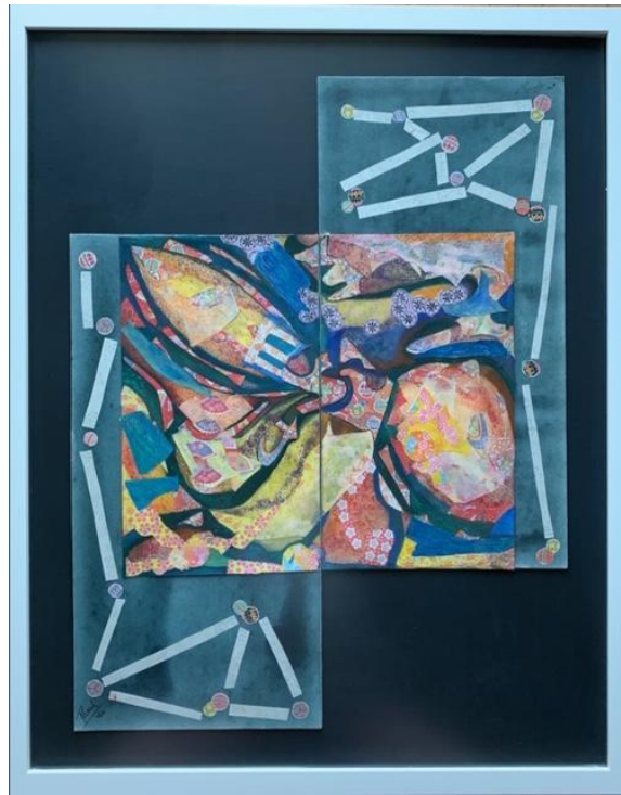
Magical Synergies. Size: 16" * 8" (each panel). Medium: Mixed media on canvas board

Parul Mehra started her creative process as an architect. Soon after, however, the study of colours and spaces took Mehra to explore new dimensions until reaching the artistic expression that characterizes her artworks today.